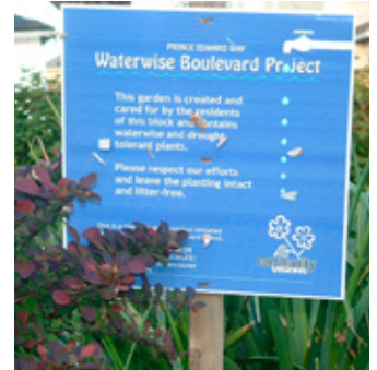
Community maintained xeriscape demonstration project.