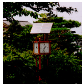
Integrate renewable energy with landscape elements.