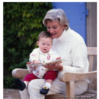
Shared seniors centre and nursery.