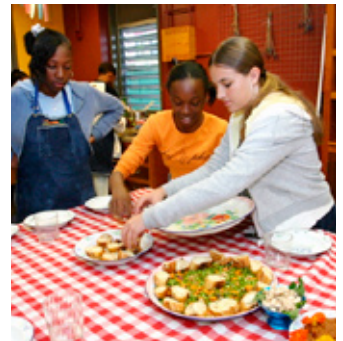
An incubator kitchen provides local business opportunities.