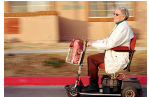
Active seniors need universal accessibility.