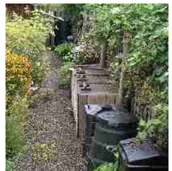
Compost Demonstration Garden.