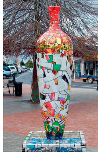
Waste to Art Program.