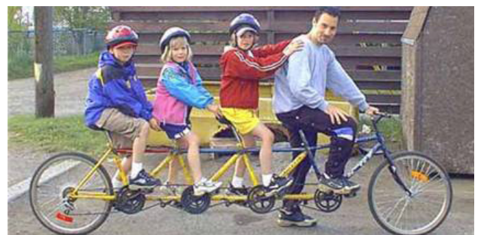
Village Cycling Club