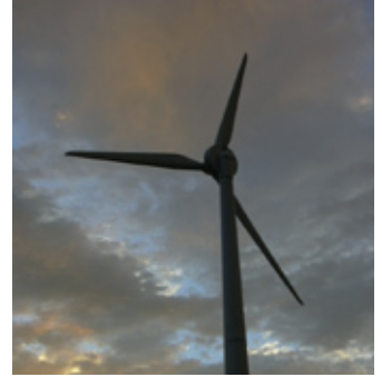
Offsite green power offered at time of purchase.