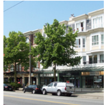
Landscaping can be used to provide shading and reduce the heat island effect.