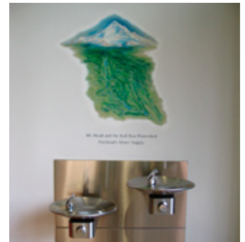
Use signage to raise awareness.