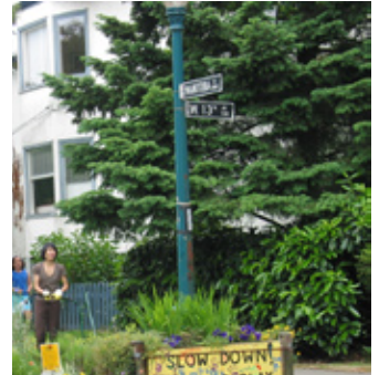
Create a safe neighbourhood.