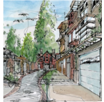
Country Lanes take advantage of marginal street spaces such as narrow lanes.