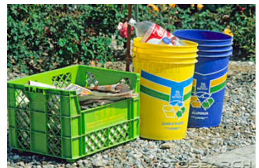
Integrated Waste Management Program.