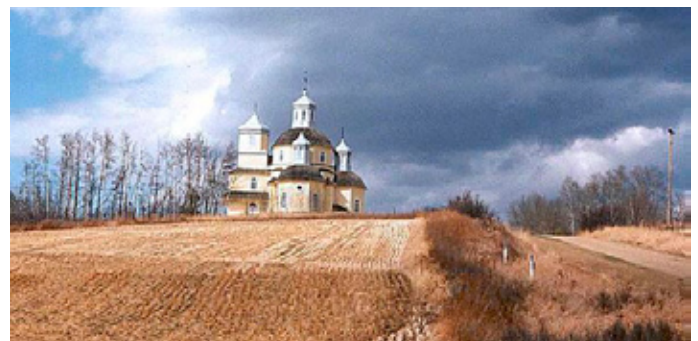
Celebrate our heritage.