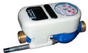
Highly visible resident water use meters.