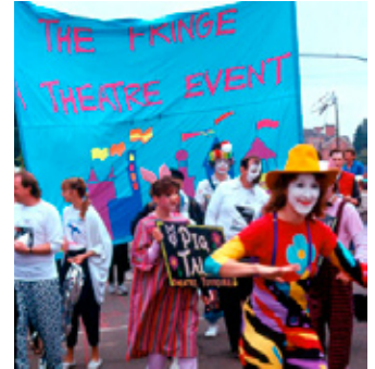
Celebrate our diversity.