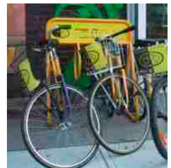
Bike Share Program.

Informed and active residents keep neighbourhoods strong.