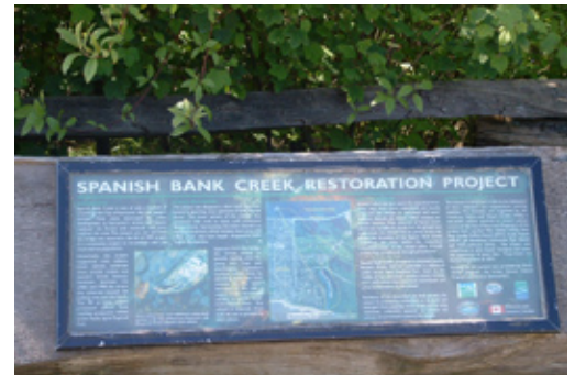
Partner with local organization to restore or enhance natural spaces.