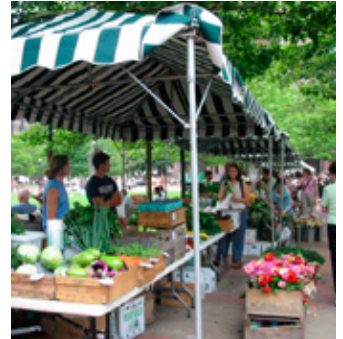
Farmers markets draws the community together.