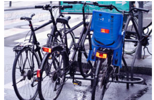
Provide adequate bicycle lock-ups.