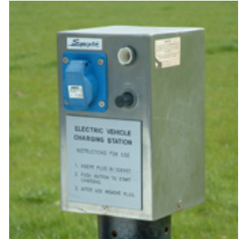
Green power electric vehicle recharging station.