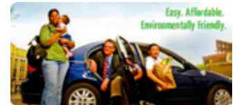
Car Share Program.

general intent / The detailed design decisions that enable sustainable development at Emerald Hills Urban Village must also foster sustainable living. The Strategies and Initiatives/Activities identified below represent an initial framework and point of departure for generating a Fostering Sustainable Living Program at the Urban Village. They are intended to provide the integrated design team with the sustainable living lens that is to be applied to all detailed design decisions. It is recognized that these lists will evolve and be refined as the detailed design for the Urban Village emerges.